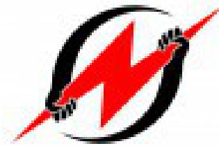
Power Technical Early College